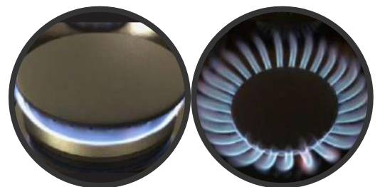
Ultra Low Simmer and High Power Dual Burners