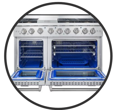
Large Capacity Oven with Blue Interior