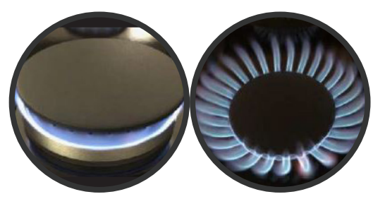
Ultra Low Simmer and High Power Dual Burners